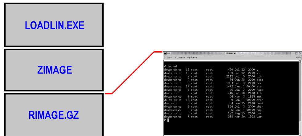
Figure 2: RIMAGE.GZ contains the complete root file system

In other words: After the boot-procedure the RAM-disk builds an exact copy of the files and directories in RIMAGE.GZ.