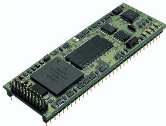
Figure 1: The DIL/NetPC DNP/5280 with a ColdFire MCF5280 Microcontroller

The DIL/NetPC offers the footprint of a standard 64-pin DIL socket with 2.54mm centers and all the hardware and software features necessary to add high-speed networking capabilities to any product design. The DIL/NetPC is developed specifically for products that need to be connected to 10 or 100 Mbps Ethernet-based TCP/IP networks with minimum development costs.